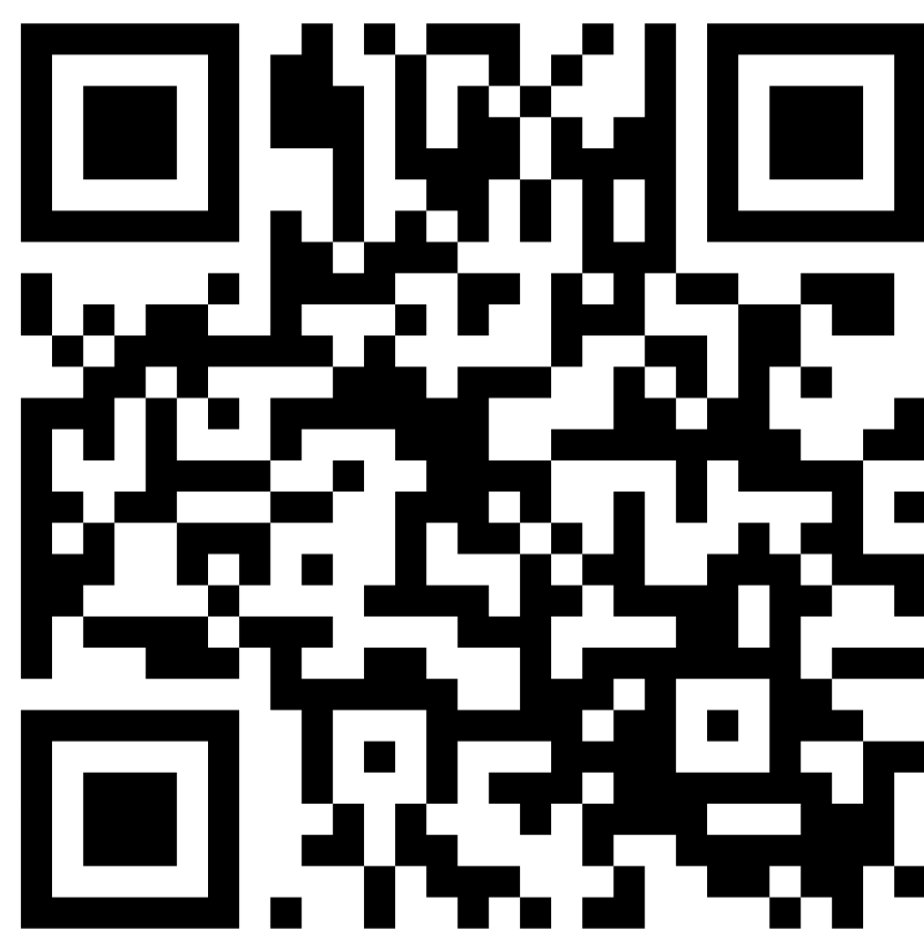
Caymas Cash Contingency Program Rules