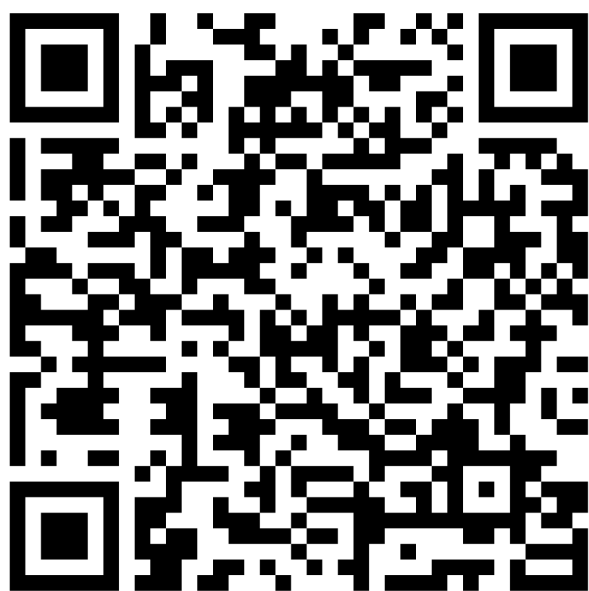
First Flight - Phoenix Contingency Program Rules